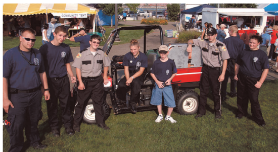
Police and Fire explorers at an event