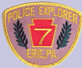
The Erie Police Explorers patch, which is worn on the dress uniform