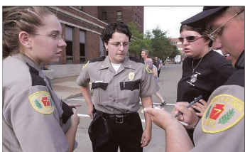
Explorers meet at Celebrate Erie to review and share information

The Erie Police Explorers is a non-profit organization that is comprised of fourteen to twenty-one year old students who have an interest in the field of law enforcement as a career. The students involved participate in a variety of activities throughout the year. From walking a security beat at events such as Celebrate Erie to holding fingerprinting sessions for children, the students in-